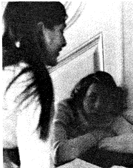
Delegates Prepare Materials I

At an overall look, the Materials Workshop was once again an overwhelming success.